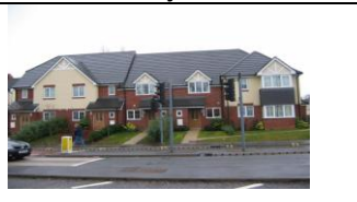
On the A3 at Cowplain