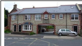
Chichester, near station

Here's what has been achieved locally on similar sites.