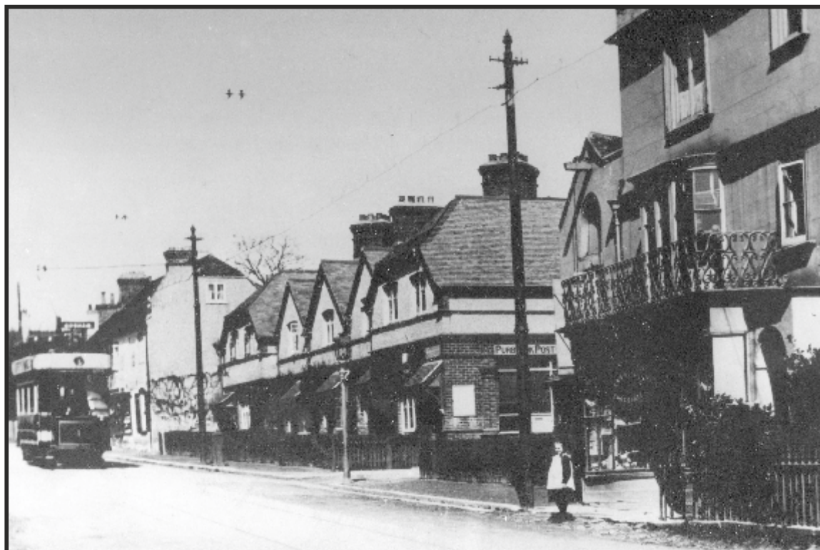
London Road Circa 1915